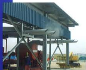
Fire Pump System