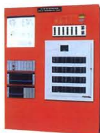
Fire & Gas Detection and Alarm Systems