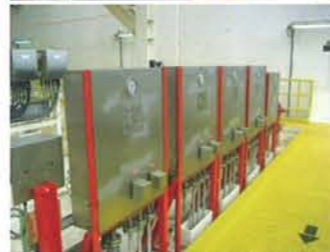
Pneumatic Deluge Valve/ Fusible Plug Charging Panel