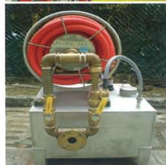
Foam Hose Reel Station