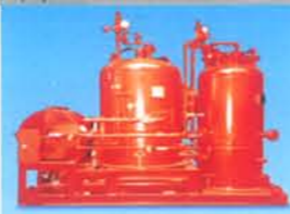
Twin Agent (Dry Chemical/Foam) Skid