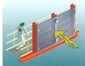
Radiant Heat Shields