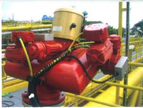
Remote Control Monitors