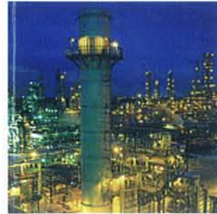
Power Plant / Generation