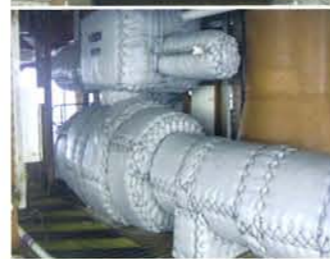
Passive Fire Protection Systems