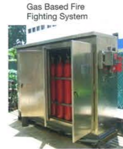
Gas Based Fire Fighting System